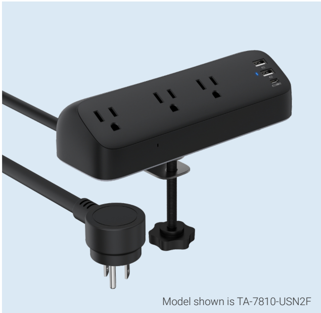
Model shown is TA-7810-USN2F