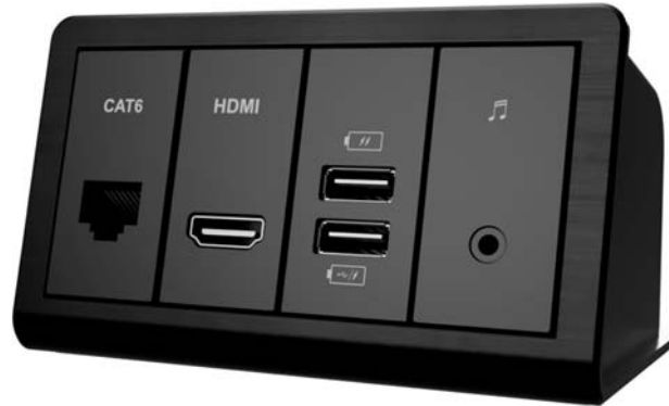
MiniClip Desktop Housing with an example module configuration.

The Mini-Clip Desktop Housing brings the flexibility of the Mini-Clip range to the guest room desk or nightstand. A subtle brushed metal finish complements the Mini-Clip modules perfectly and can house up to four 25mm modules or two 25mm modules and a 50mm module.