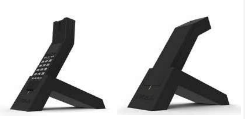
Matching trimline available.

Supports multiple front/back facing RediDock remote handset kits.