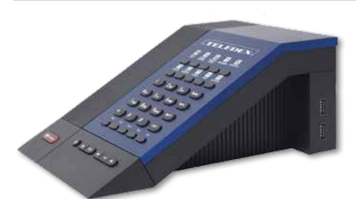
Built-in USB ports support guest smart device charging requirements.